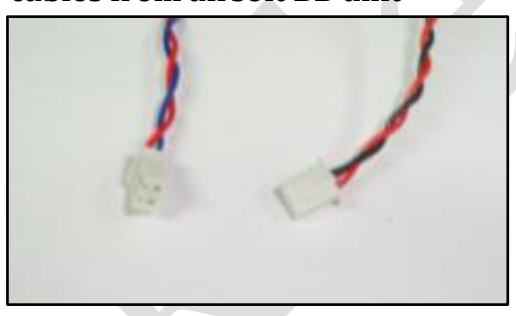
1x cable red/blue 1x cable red/black